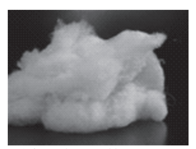
Fig. 1. The goat wool: a) before down processing and b) after scouring and dehairing process