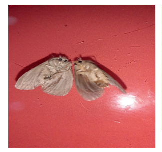
Fig. 1. Male and female

The eggs are circular in shape, stick tightly to the fig leaf, with a low top compressed from the top and bottom. The incubation period for eggs lasts 7-10 days, with an average of 7.8 days. The eggs hatch into larvae (Figures 1 and 2, Table 1).