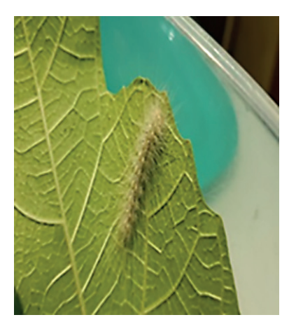
Fig. 6. Fourth age

The presence of larvae of this age can be inferred from the presence of skeletons skins and by the level of the chewing, which includes the two surfaces of the plant leaf, and from the abundance of excrement on the lower leaves, which is in the form of black-colored masses resembling crushed peppercorns, after which the larva molts to the fourth age, which takes 5-6 days with an average of 5.37 days (Figure 6), and then moult to the fifth instar, which takes 5-7 days with an average of 6 days (Figure 7), at this stage, the level of chewing in leaves increases to include all the plant leaf, leaving the veins only, The larvae move from leaf to leaf by walking, and sometimes they can go down, When the growth of the larvae of the fifth age (which takes 18-26 days) is completed, the larvae leave the leaves and fall to the soil looking for a place to be pupate, or it may be among the fallen and wrapped fig leaves or in the plant residues in the soil. It may climb the nearby walls and enter inside the house, due to the lack of air current and the warmth of the area, the larva pupate in the skin of the last molt, transforming into a obtect pupa inside a simple silky cocoon, where the pupa lasts 10-