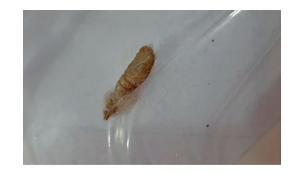
Fig. 7. Fifth age larva