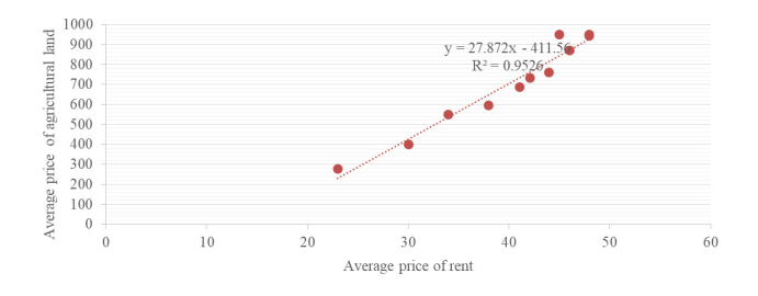
Fig. 3. Capitalization of land

acteristics – high return on reporting risk, low correlation (interdependence) to traditional classes of investment assets, strong connection with the growth of an emerging market with low political risk, approaching land prices in EU countries and obtaining a secure monetary income. Agricultural land in Bulgaria is an undervalued asset, the price and occupies the lowest place among land prices in EU countries. The natural price approximation creates an attractive potential for growth of over 6% per year on land in Bulgaria (average for the period under review 14.30%). Another very important reason for growth is the consolidation of individual land properties. In countries with stable land relationships the payback period is 25 years in Bulgaria the average is 7.33 years, and only in 2020 the payback period is nearing 6.2 years (Figure).