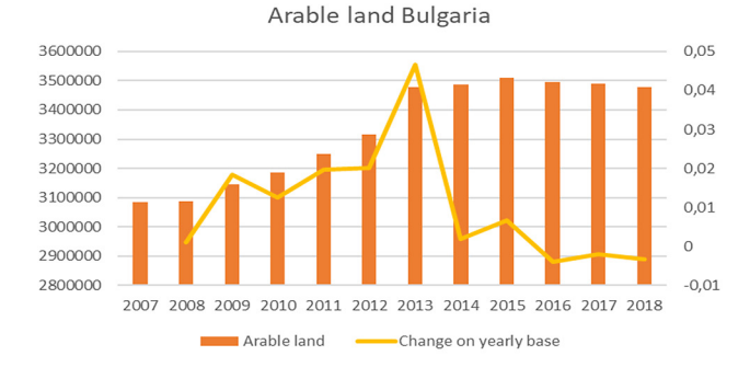
Fig. 1. Arable land and percentage change in Bulgaria

There are a large number of small owners in Bulgaria, and most of them do not manage the land they own. In Bulgaria, 1.86 million citizens and companies own agricultural plots, owning a total of 4.4 million hectares of agricultural land, which represents about 88% of the utilized agricultural area (UAA). In Bulgaria the situation does not differ from the general one in Europe, as 0.1% of all owners own 21% of the land. In the beginning of the period the largest is the group of owners who own up to 10 ha. They own 7.3 million prop-