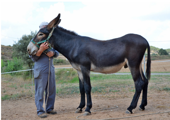
Fig. 1. A jackass belonging to Catalan Ass breed

We studied adult 8 animals (1 male and 7 females, age range 4-7 years) belonging to Catalan Ass breed (Figure 1). Subjective assessment of clinical signs, visual and palpable abnormalities of flexor tendons was done. The equipment was set on the musculoskeletal scanning frequency pre-programmed according to the probe attached. No animal did present locomotory dysfunction or injuries related to the skeletal muscle system. All animals included in this work were officially registered as pure breed in the stud-book.