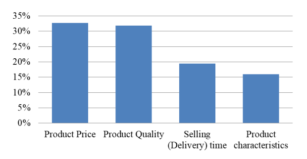
Fig. 3. Elements that are included in the agreements (formal/informal)

that sell their production to the buyer through informal or formal contracting outlined the two primary elements that are agreed upon in the contract as product price and quality. As is shown in Figure 3, the third element that is usually found in the contracts between farmers and buyers is selling time, while the fourth is the product characteristics.