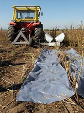
(a) (b) Fig. 3. Seseme seed losses by the Wintersteiger – Hege 160 (a) and by the specialized device (b) in 2018

For the percentage of seed losses in 2018 were obtained the following regression equations: