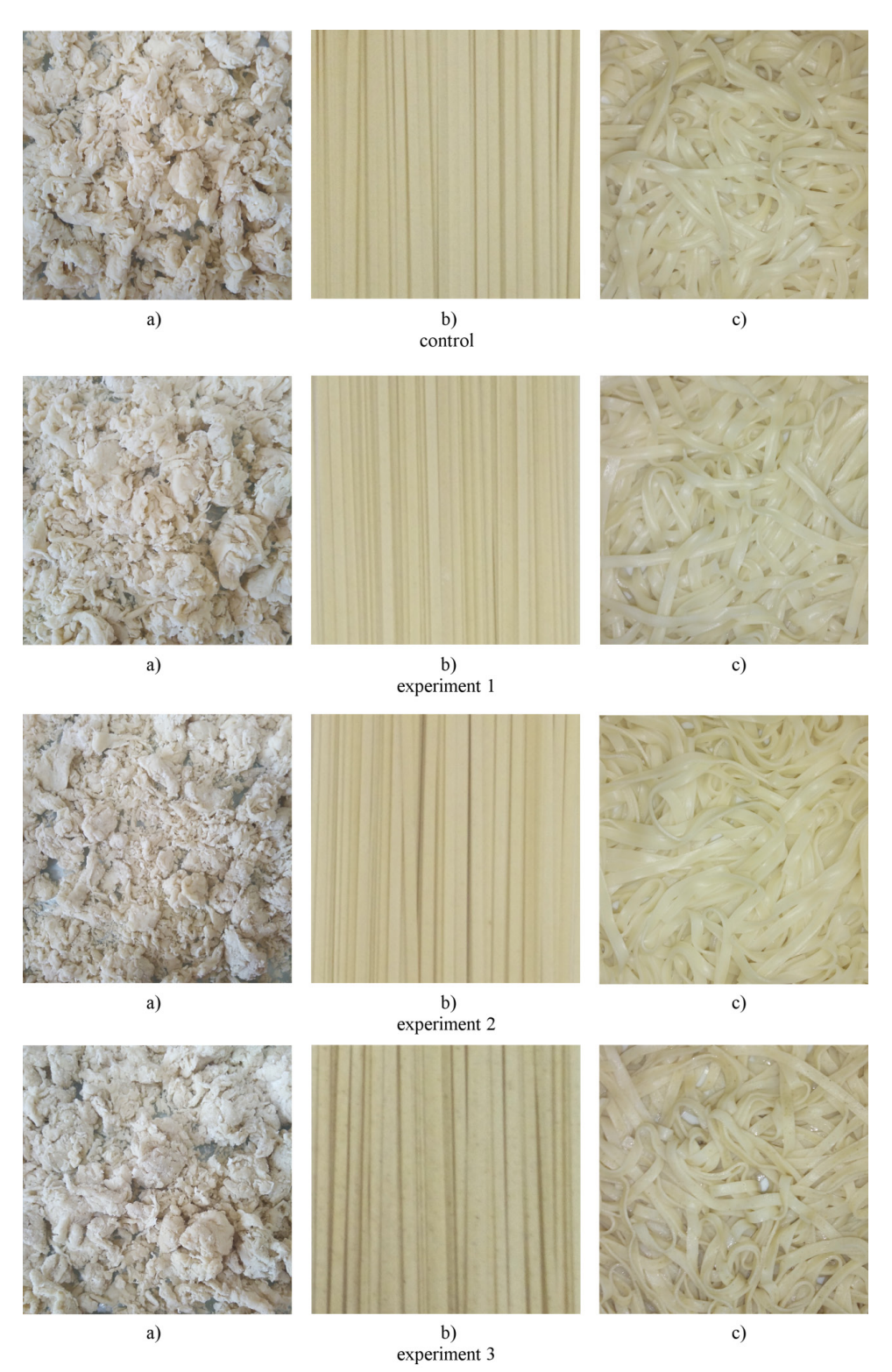
Fig. 3. Model samples of the semi-finished and finished pasta a) pasta dough, b) pasta before cooking, c) pasta after cooking