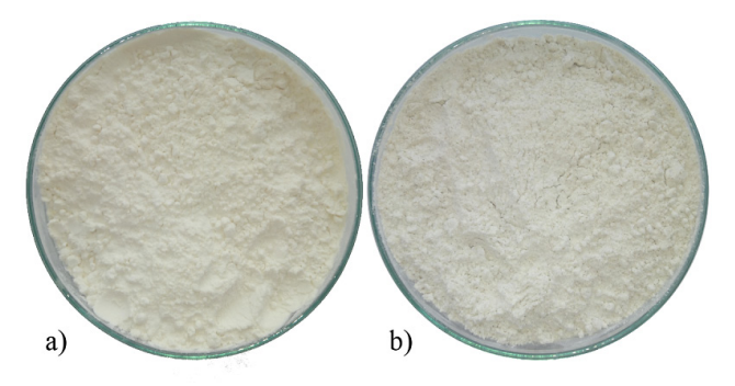
Fig. 1. The appearance of the studied flour a) wheat flour, b) multi-grain flour

At the first stage of the research, we studied the organoleptic characteristics of the used plant raw materials (Figure 1). High-grade baking wheat flour is a fine powder product characterized by a creamy white color; it has a slightly sweet taste and an inherent smell. Whole-grain multi-grain flour is light gray with interspersed grain shells with a brown-olive tone; it has a taste and smells typical of the grains included in its composition, without extraneous flavors and smells.