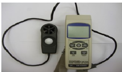
Figure 1. Lutron EM-9300SD

The illumination level in the milking room was reported using a Lutron EM-9300SD (Fig. 1.)